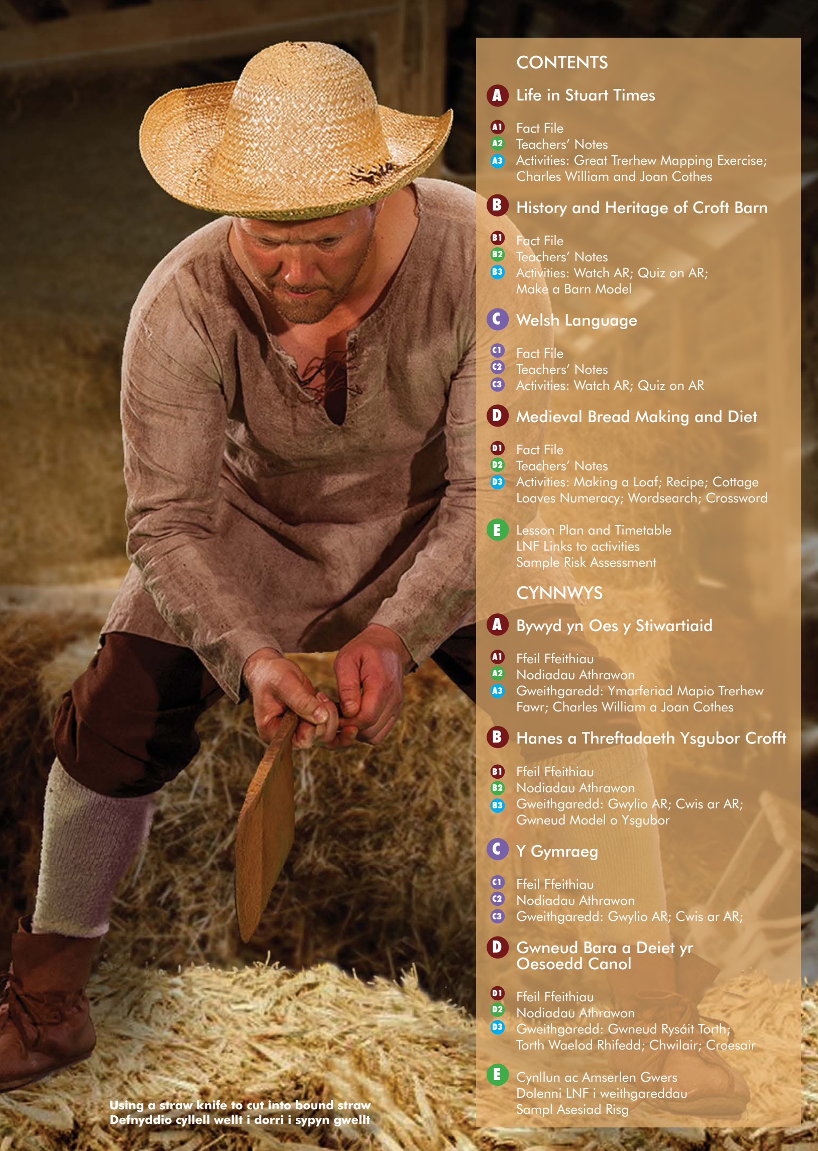
Using a straw knife to cut into bound straw Defnyddio cyllell wellt i dorri i sypyn gwellt